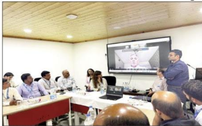
IIM Jammu during programme for MetLife India Insurance Company Ltd.