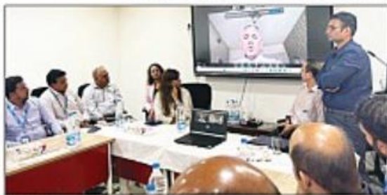
IIM's Management Development Programme in progress.