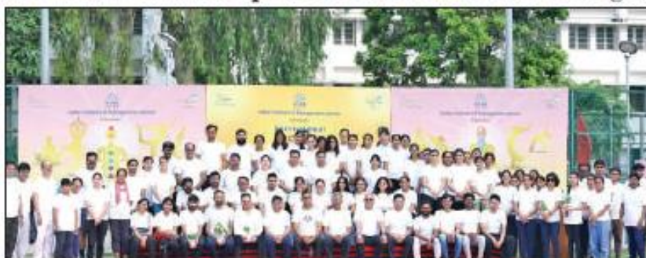
IIM Jammu faculty and others dignitaries during Yoga camp.

The International Yoga Day (IYD) 2023 was observed at IIM Jammu Canal Road Campus . The event commenced with the light-