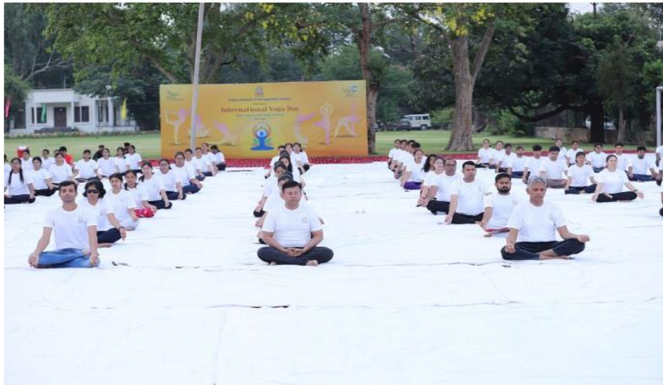
The International Yoga Day (IYD) 2023 was observed on 21st June 2023 (Tuesday) at IIM Jammu Canal Road Campus.