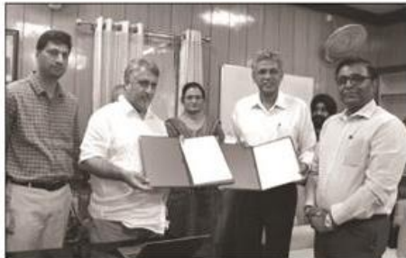
Dignitaries exchanging copies of MoU during a programme organized by IIM and SDD at Jammu.